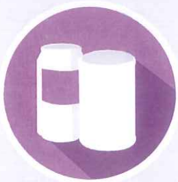
Aluminum, Tin & Metal Cans