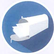
Junk Mail, Glossy Paper, Magazines