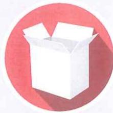
Flattened Cardboard Boxes