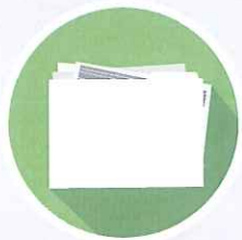
File Folders, Office Paper, Envelopes