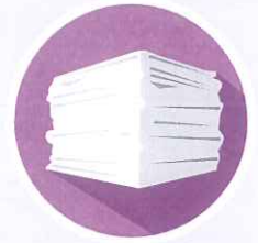
Newspapers, Catalogs, Phone Books, Paper Bags